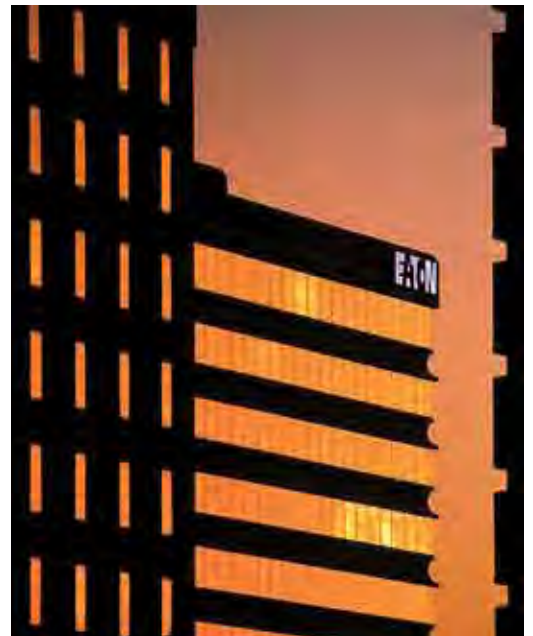
6551 and 6553 Loisdale Court office buildings