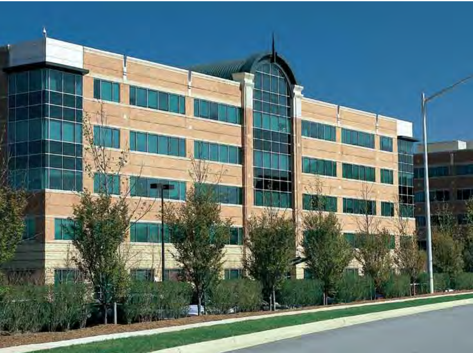
6350 and 6354 Walker Lane at Metro Park, part of a 1.3 million square-foot office project in Fairfax County