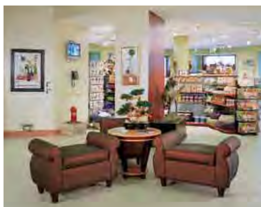
Olde Towne Pet Resort