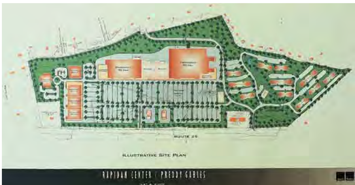
Concept plan for Rapidan Retail Center and Preddy Gables, Greene County