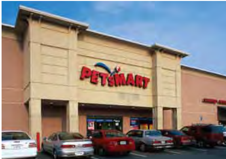
Best Buy Center