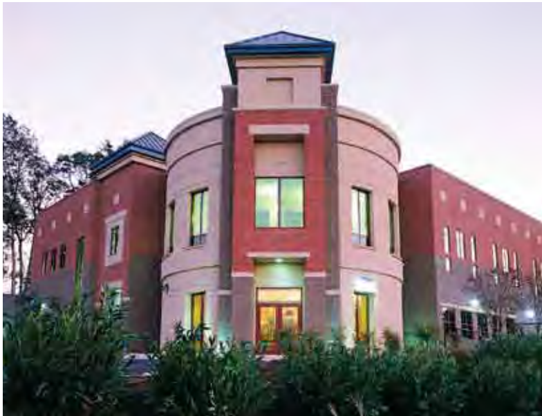
Olde Towne Pet Resort, Springfield