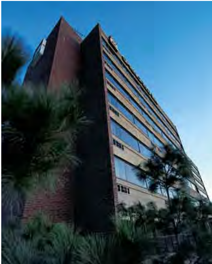
Best Western-Springfield Inn