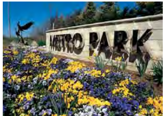
Parkway Entrance to Metro Park