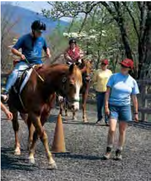
CART riders at the Fried Family farm gain confidence and happiness with the help of specially trained horses and volunteers.