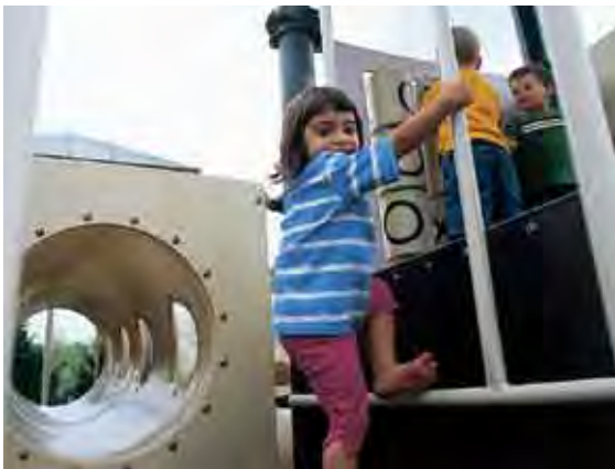
Gray Rock residents in Albemarle County enjoy one of the many amenities at our residential communities.