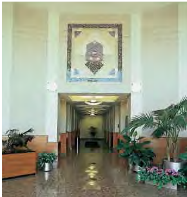
Lobby of 6354 Walker Lane