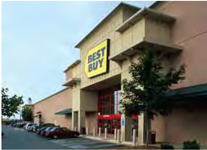
Award-winning Best Buy Center