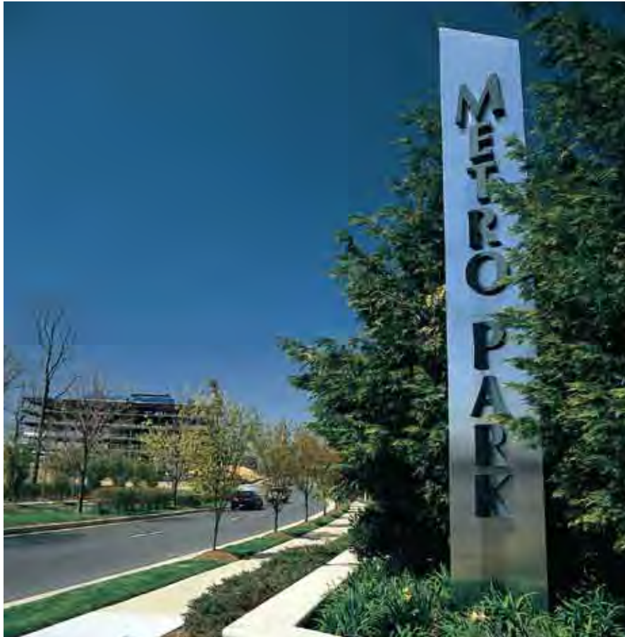
Construction continues at Metro Park, a complex of over 1 million square feet of class-A space.