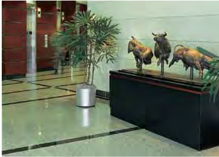
6359 Walker Lane lobby with sculpture by Walter Matia